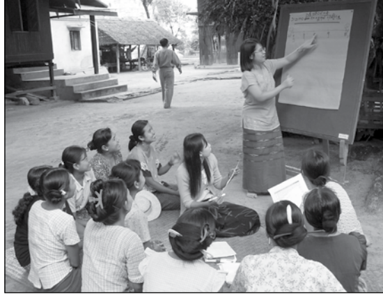
UNIAP and UNDP Myanmar field teams review methods and possible issues (left) before conducting focus groups in target villages (right).