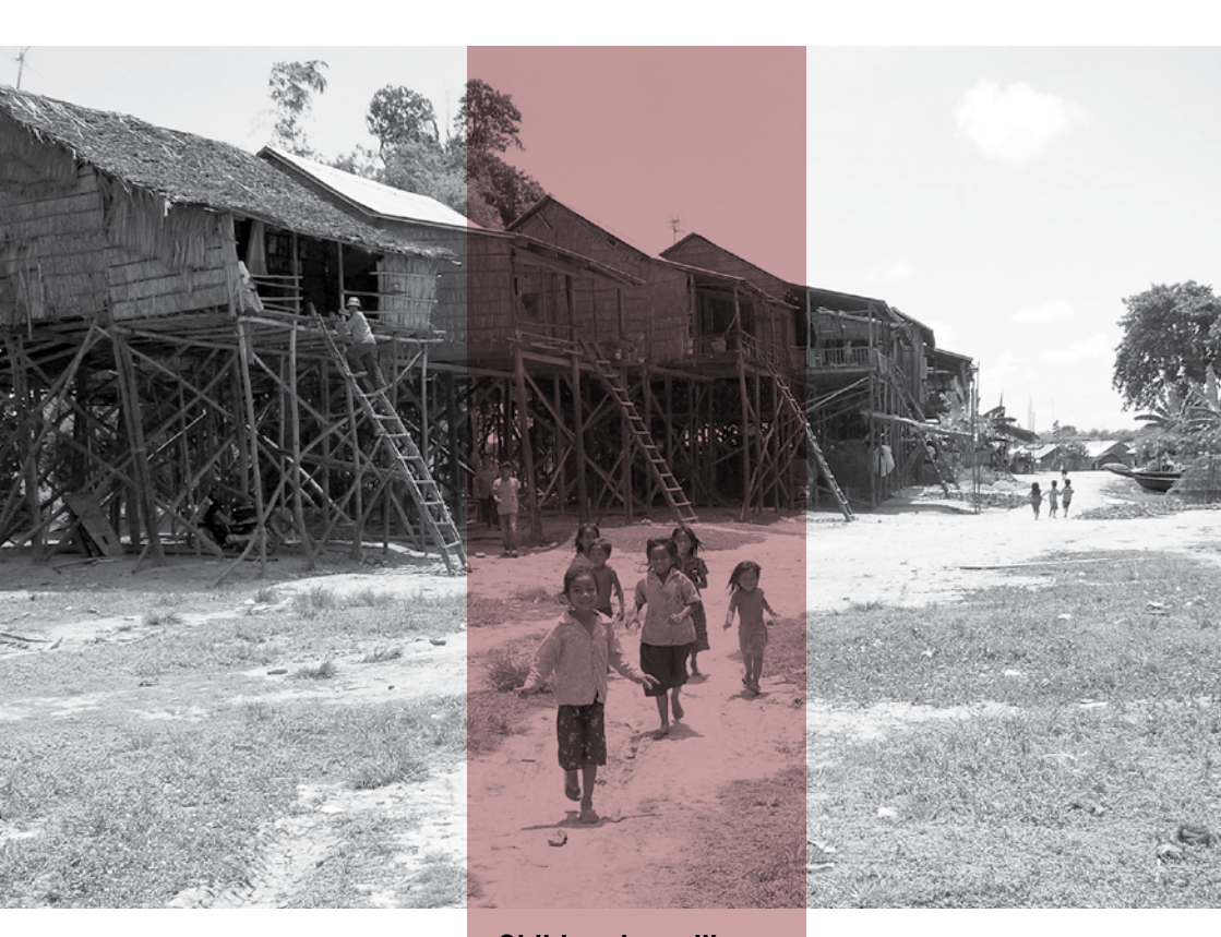
Children in a village in Kandal province, Cambodia

The UNIAP Regional Team Bangkok, Thailand September 2008