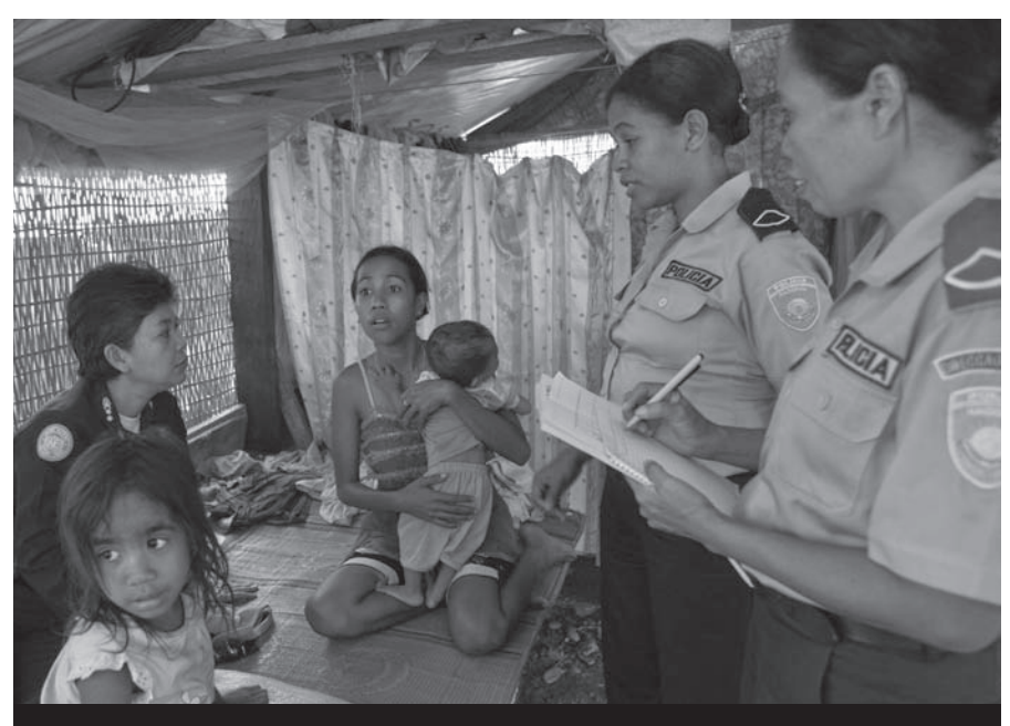
UNPOL officers visit IDP camp, December 2007.

The police must make a concerted effort to gain the public's trust. Police will have to invest time and effort to forge solid working relationships with local community groups, and to discover what their needs are and respond to them. Building a network of regular contacts in civil society is one of the best ways to bridge what is often a wide gap between the community and the police. Explicitly building a relationship based on trust and mutual exchange of information with groups representing women and children is an important element. To achieve this objective, many police in post-conflict countries have established community police units.