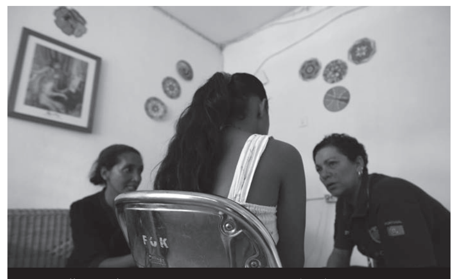
UNMIT officer comforts rape victim, August 2007.

In many post-conflict states, the population has scarce regard or respect for the police, whose image has suffered. In such contexts, both the host state and UN Police are faced with the challenges of restoring or creating the good image of the national police and law enforcement, so as to reconstitute a viable law enforcement body following atrocities or the total breakdown in the rule of law. It is difficult and challenging to make serving with the new police force an attractive career option for women while working to equip the police service with the means of deal with the post-conflict pandemic of genderbased violence.