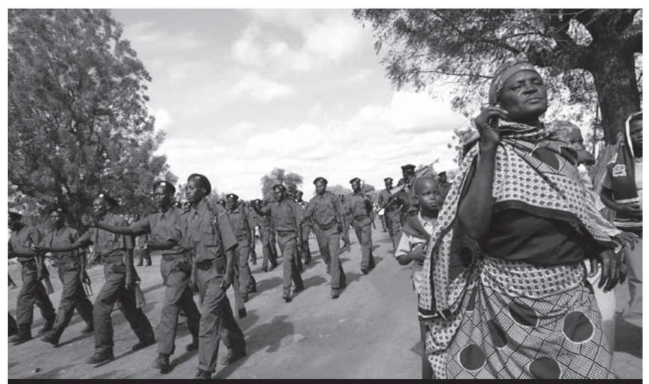
Graduation ceremony for police officers trained by UNMIS, November 2006.